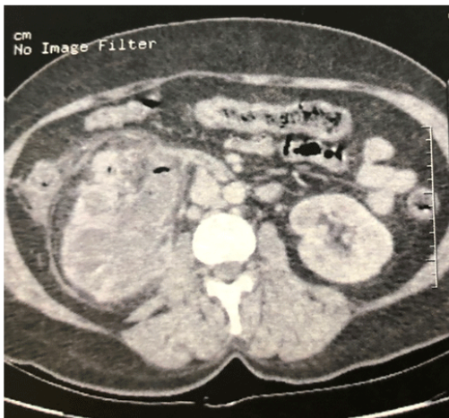
Figure 1. Transverse CT scan section showing renocolic fistula

Uro-digestive fistulas represent abnormal communication between the urinary tract and the digestive tract. They can be high intraperitoneally mainly enterovetic or low subperitoneal urethro-prostato-rectal. We report the case of a patient presenting pneumaturia, occurring at the end of urination, with foamy urines. The scanner shows a renocolic fistula. It benefited at first by an ileos to my with drainage of the pyonephrosis. Then in a second temos of a nephrectomy and a restoration of digestive continuity.