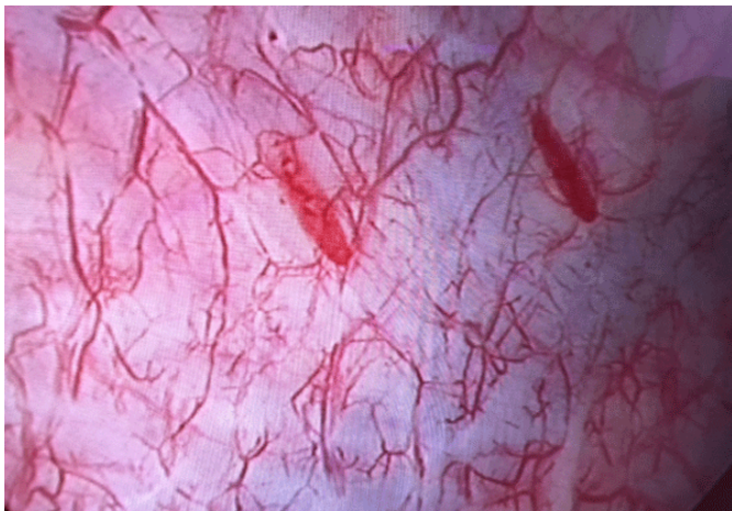
Figure 1. Aspect of the mucosa at the beginning of the hydrodistension

We noted then that during the filling this fragile mucosa “cries of blood” (Figure 1,2). A therapeutic effect allowed the patient to be relieved. An improvement in symptomatology was observed in this case for six months. A biopsy performed during cystoscopy made the diagnosis.